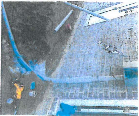
URD METER BASE